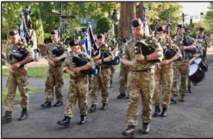
The band put on a stirring performance.