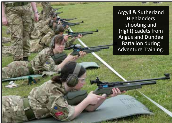
Argyll & Sutherland Highlanders shooting and (right) cadets from Angus and Dundee Battalion during Adventure Training.