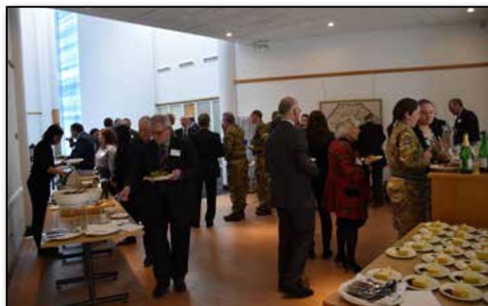
Members enjoying lunch.