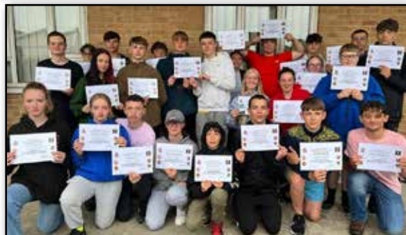
All participants at the Angus and Dundee Battalion camp received certificates. Below: The Battalion's cadets visited the Armoured Centre at Bovington.