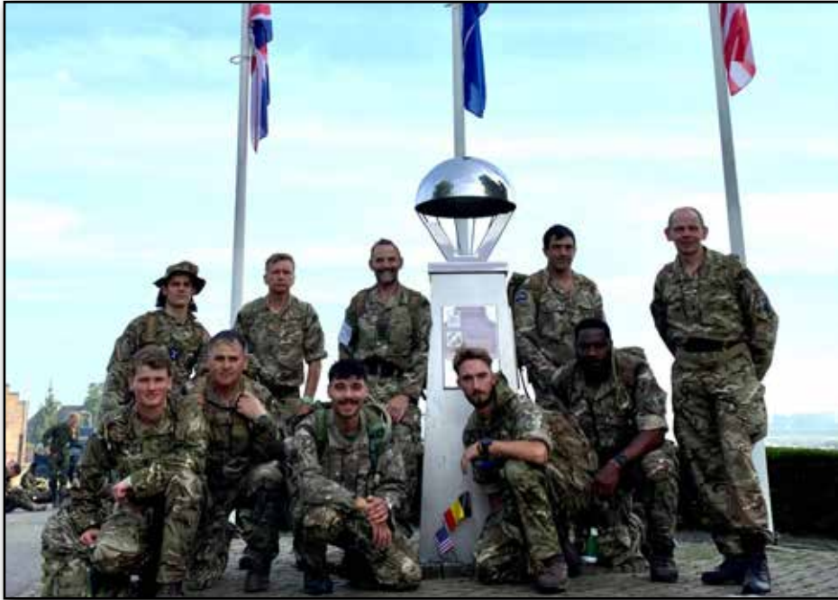
The Best RAF Team at the Nijmegen Marches. Top right: The team's trophy and (right) the ten participants from 2622.