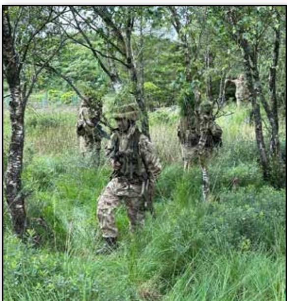
The Black Watch Battalion gorge walking at Luss and (right) Black Watch Cadets enjoying fieldcraft at Garelochhead.