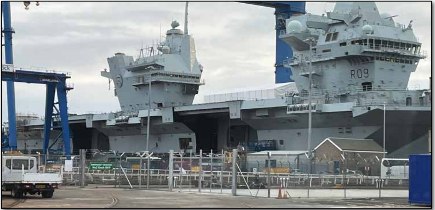
HMS Prince of Wales at Rosyth. The ship sailed out of the Forth in late July after nine months in dry dock.