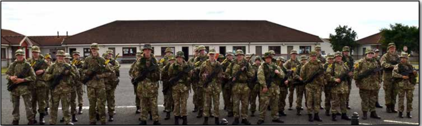
Cadets from 1st Battalion The Highlanders during their camp at Barry Buddon, near Carnoustie.