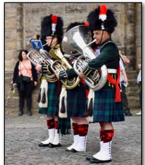
From left: The Salute was fired by 3rd Regiment Royal Horse Artillery; The Lord-Lieutenant inspects the Troop; Music from The Black Watch.