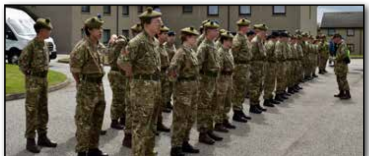
1st Battalion The Highlanders being taught first aid skills and (right) cadets from 2nd Battalion The Highlanders on parade at Boddam.