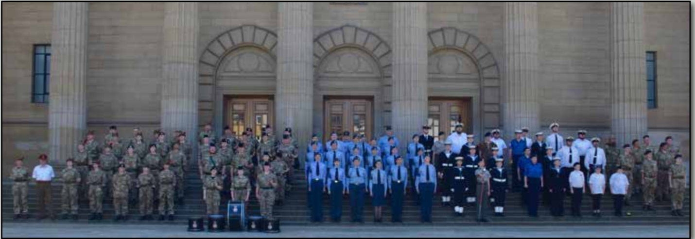
Some of the cadets and Cadet Force Adult Volunteers who took part in the event.