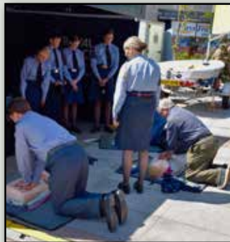
Above: The Services competition was hard fought. Above right: RAF Air Cadets teaching lifesaving skills.