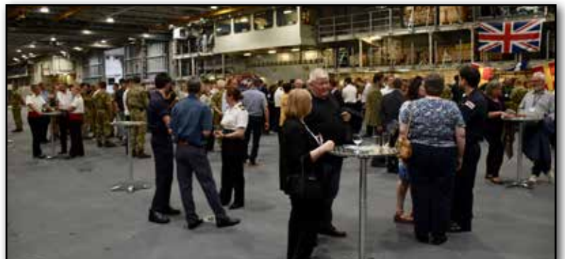
Left: Port of Aberdeen signed the Armed Forces Covenant. Above: The reception was held in the 65,000 tonne, 284-metre long ship’s internal hangar.