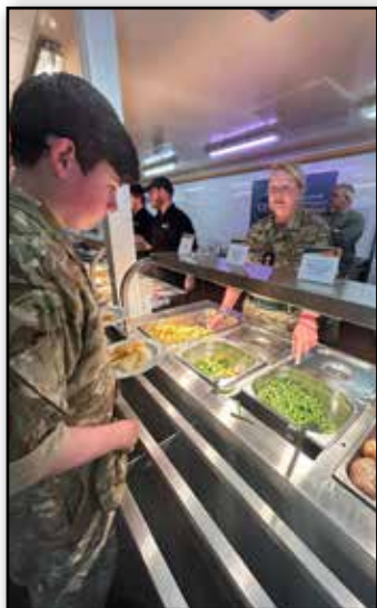
Lunchtime at Garelochhead.