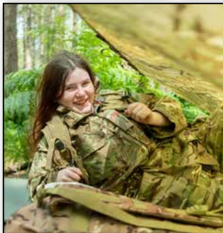
Argyll & Sutherland Highlanders Cadets (above and below) during fieldcraft lessons at Chickerill, Dorset.