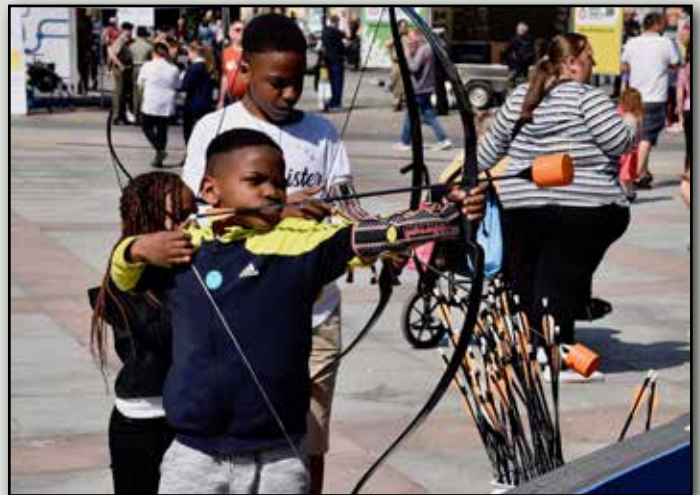
Archery was popular with visitors.