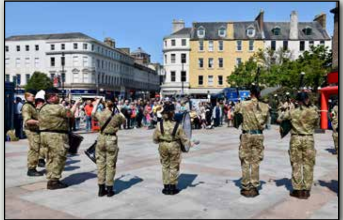
The Pipes & Drums played to a sizeable audience.