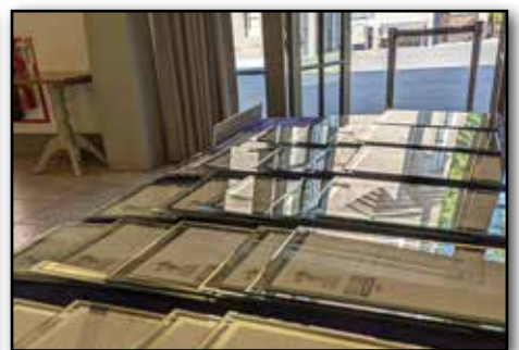
ERS Silver Award certificates.