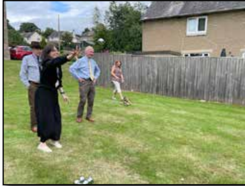
Staff retireals were marked with a lunch and garden games at HRFA HQ in Dundee.