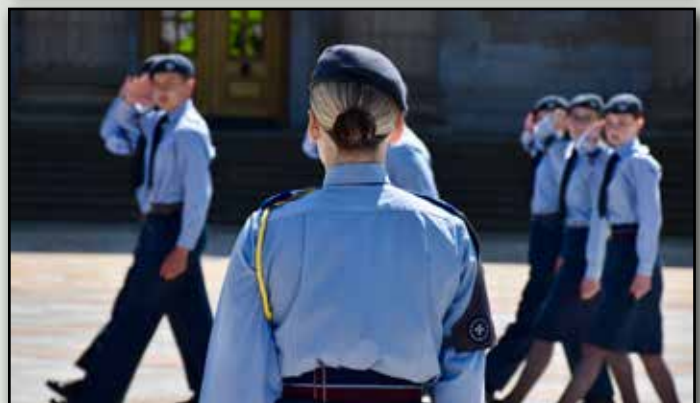
RAF Air Cadets put on an excellent display of drill.